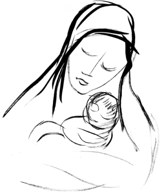
Drawing by Thomas Merton. Used with permission of the Merton Legacy Trust and the Thomas Merton Center at Bellarmine University.

Mother Seton House PO Box 673 Fryeburg, ME 04037